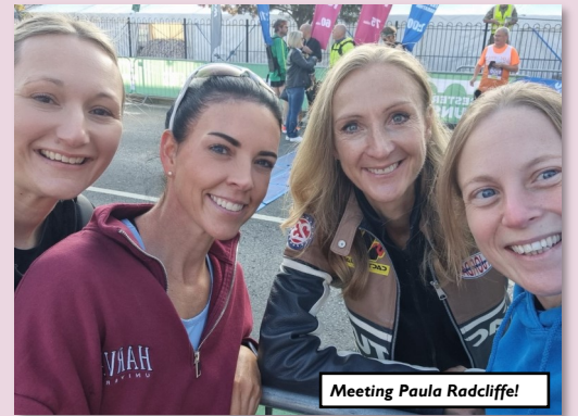
Meeting Paula Radcliffe!