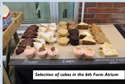
Selection of cakes in the 6th Form Atrium

The bespoke 6th form catering facility from 10.45-11.35 and 12.35-13.35