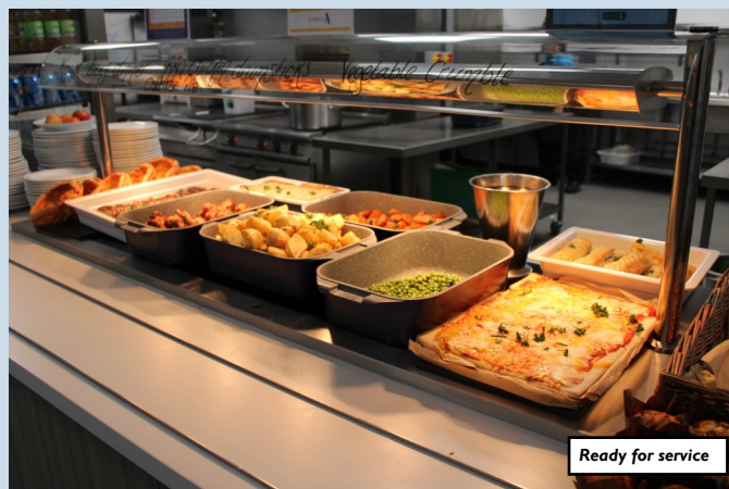
Ready for service

offering includes a speciality coffee, hot beverages & chilled mineral waters, fruit juices and sodas with classic breakfast snacks, sweet treats, traybakes, cakes, ambient savoury & sweet menu products. Lunch includes made to order toasties along with the 3-week menu cycle.