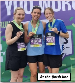
At the finish line