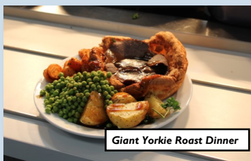
Giant Yorkie Roast Dinner

The main school catering services 'In Omnibus Foodelis' consist of the following: morning break breakfast style menu offering with an extensive selection of both classic and speciality hot & chilled items, ambient snacks and chilled mineral water, school compliant drinks plus fruit juices from 11.15-11.35.