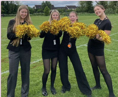
Y12 Cheer on the Rounders Players

Over the next half term, students are able to participate in a variety of rounders or cricket clubs for every age group. Every week, students are able to play in house rounders competitions that are led by PE staff and upper school students. These competitions have