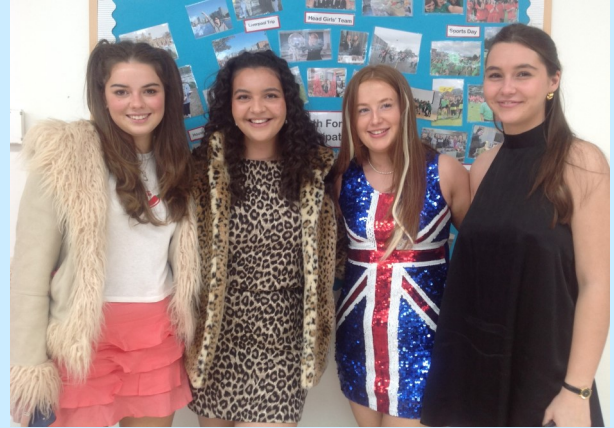
“Goodbye my friend—It’s not the end”

Year 13 are an incredible year group and we are proud of each and every one of them. They have worked hard for the last two years and we know that they are ready to sit