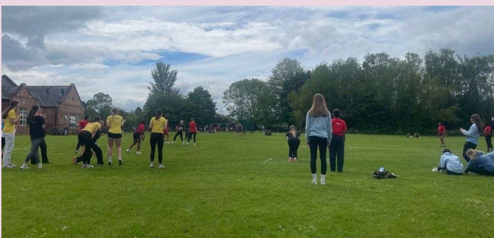
Y9 Rounders in Action!

Under 13 Indoor Cricket Shropshire Champions 2024