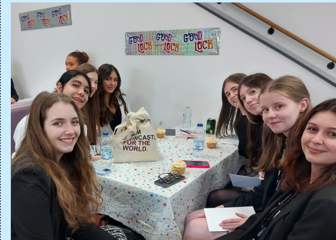
Good luck in you're A Levels Year 13!

awarded with funny certificates, personalised cards and gifts, followed by lots of special friendship photos, reminding them of all the fun they have had over the last two years as part of NGHS6.